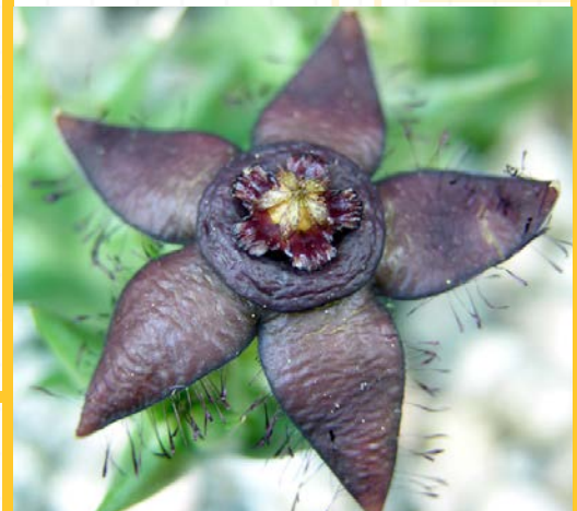
Orbea semota ssp. orientalis