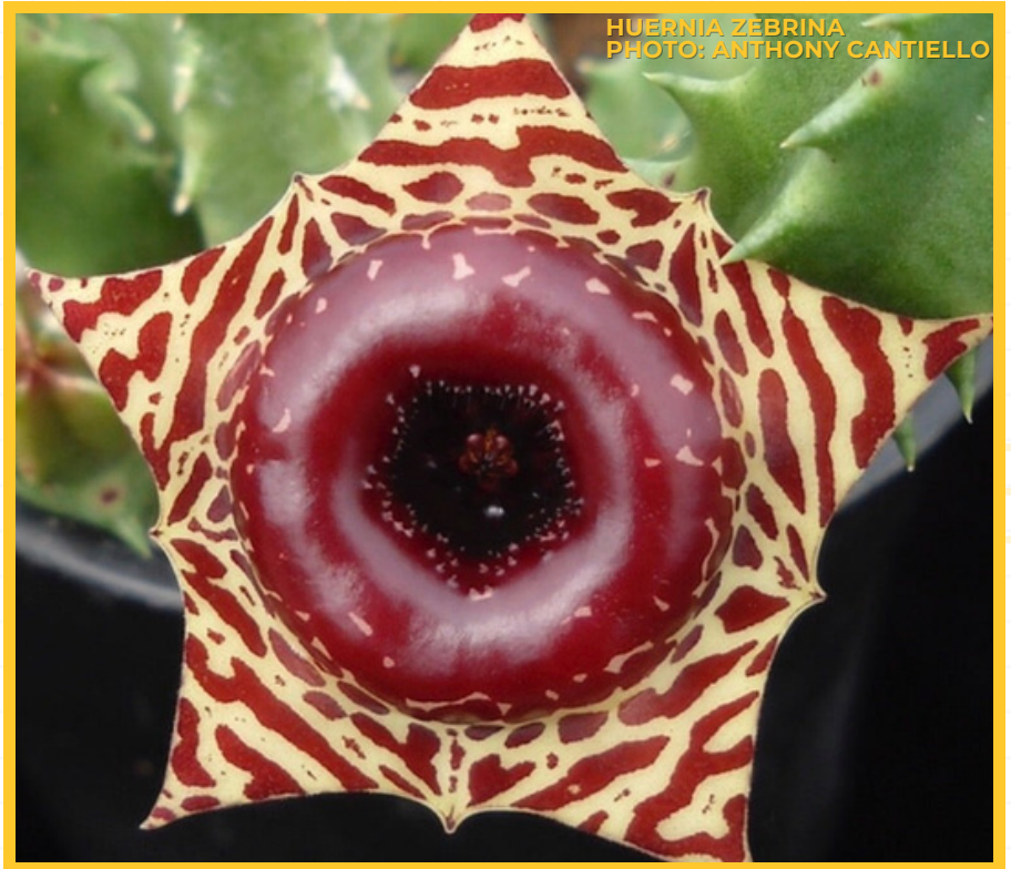
HUERNIA ZEBRINA