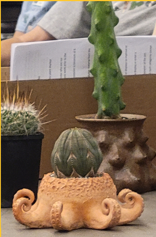
Some of the staged plants discussed at our July Staging Workshop.