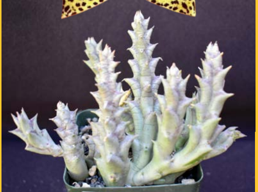
Orbea verrucosa stem