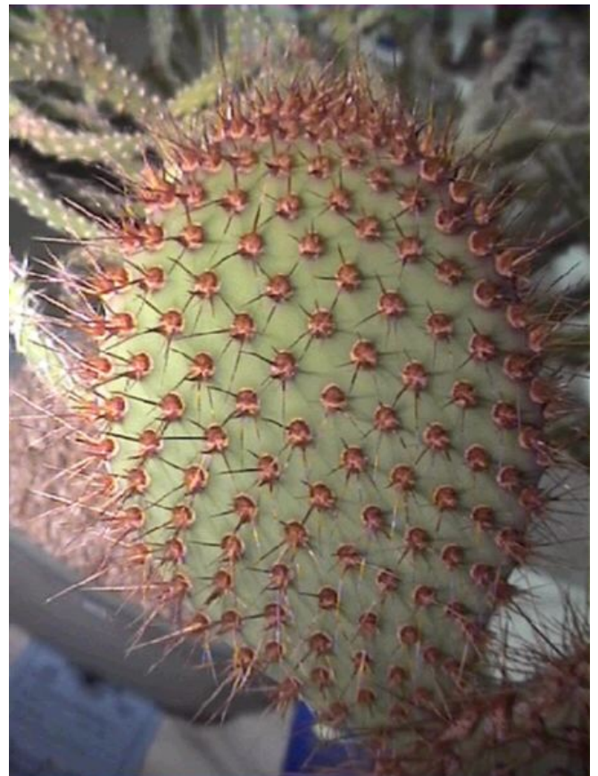
Opuntia sp. by Rene Caro