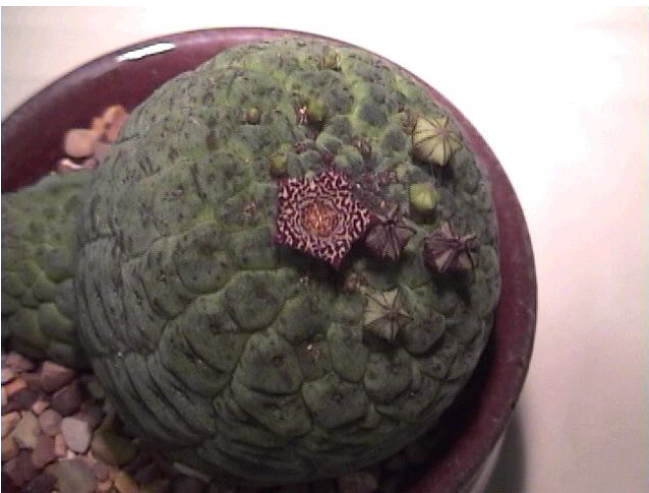
Trichocaulon dinteri