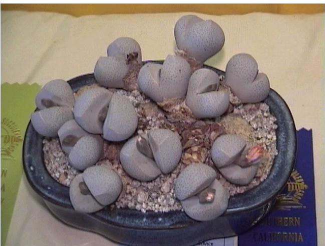
Dinteranthus wilmottii