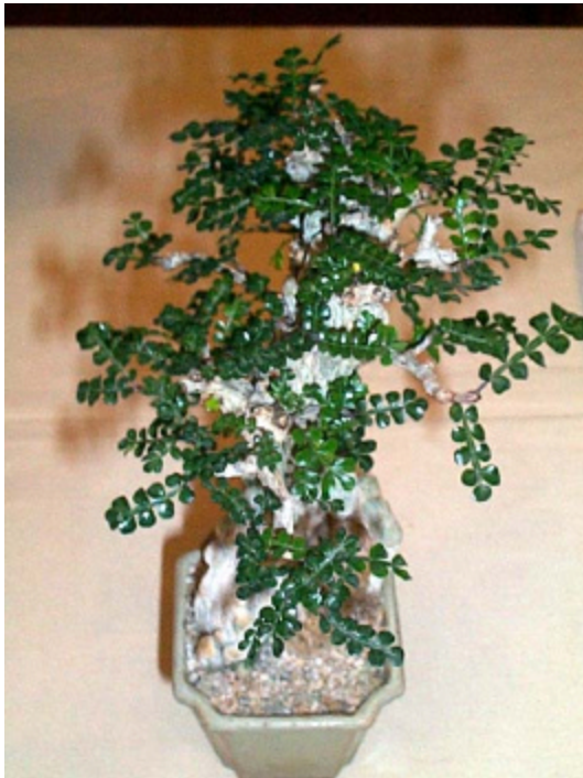
Operculicaria decaryi entered in the 2002 CSSA Show by Jim Hanna.

This month, the Cacti and Succulent of the Month are both miniatures. Miniatures are defined differently for different local shows. In most cases, the definition is a mature plant in a pot with an inside diameter less than three inches. Some shows define the miniature category as any plant displayed as a miniature. This allows seedlings and young plants to be entered as miniatures. Others require the plant to be the smallest in a genus. We'll use the broad definition for the Plant of the Month.