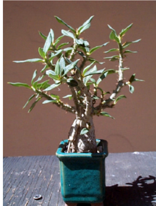
Pachypodium succulentum entered by Tom Glavich in the 2001 Winter Show.

color, geometry, and texture are all magnified in the smaller scale of miniatures.