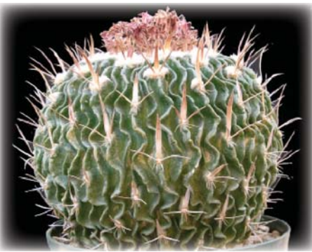
Stenocactus sp. ex Huntington Botanic Garden (HBG 52159)

All Stenocactus are spiny plants, collected more for their dense spination and the wonderful curved ribs than their flowers, although the flowers are quite showy. All of the species (there are ten) are very variable, and as a result, there are many varieties and forms that can find a place in a collection. Most of the species are reasonably small, flowering at two years, when only an inch or so in diameter. A good representative collection can be kept on a table. With age, many species can get large, filling a 6 inch pot in 4 or 5 years, and then offsetting to slowly fill a larger pot. Good cultivation in a rapidly draining potting mix and frequent fertilization during the growing season will speed this considerably.