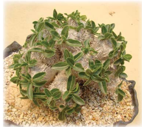
Pachypodium brevicaule - a trophy winner at the 2009 Winter Show

Pachypodium brevicaule , shown above, is a ground hugging, nearly flat caudiciform, the shortest of all the species. It comes from east side of Madagascar, near the middle of the island. The knobby top growth hides roots that anchor it to the soil.