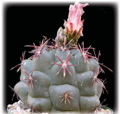
Thelocactus bicolor v heterochromus

Thelocactus are spectacularly beautiful cacti with dense multicolor spination, well shaped tubercles, and large colorful flowers. They have been a favorite with collectors since they were first discovered.