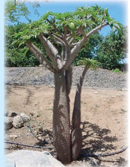
Pachypodium lamerei at the San Diego Wild Animal Park