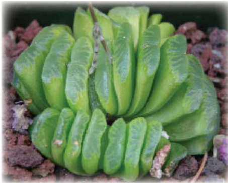
Haworthia truncata cv 'Lime Green'

The species most often seen as retuse Haworthias are Haworthia retusa , Haworthia emelyae , Haworthia magnifica , Haworthia pygmaea , Haworthia truncata , Haworthia mirabilis , Haworthia mutica , all of which have numerous forms and cultivars, and many of which have been used to produce very interesting hybrids.