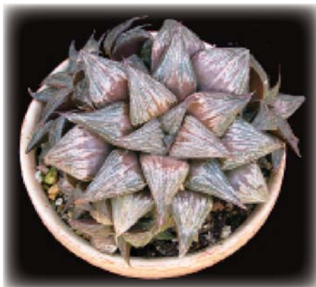
Haworthia 'Bev's Wonder'

Haworthia Bev's Wonder is a hybrid between Haworthia badia and Haworthia emelyae v. major . The cross has been done several times, and all the plants share this name, even though there are several visibly different clones in cultivation.