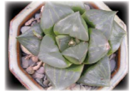
Haworthia mutica v nigra