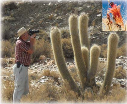
Oreocereus celsianus with bloom inset

They prefer outdoor air to a greenhouse, and need frequent turning to keep symmetrical growth.