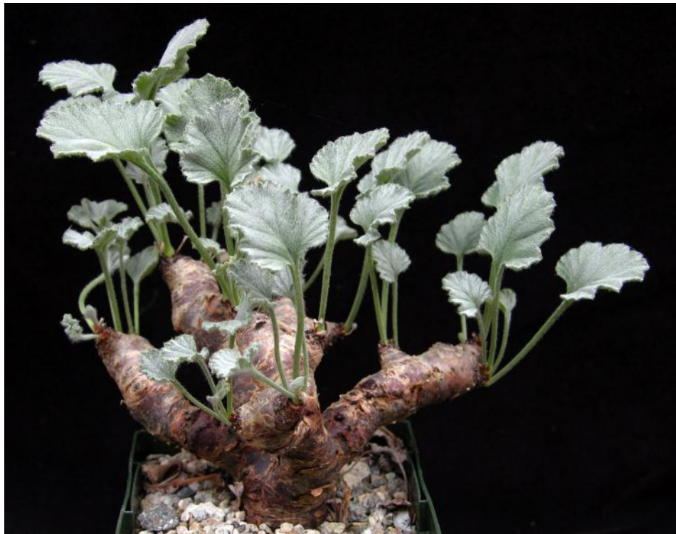
Pelargonium paniculatum (see page 7)

Some ideas: brownies, burritos, chips & dip, cookies, pizza, sandwiches, trail mix.