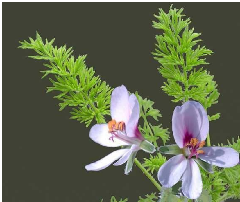
Side photo: Pelargonium echinatum (see page 7)